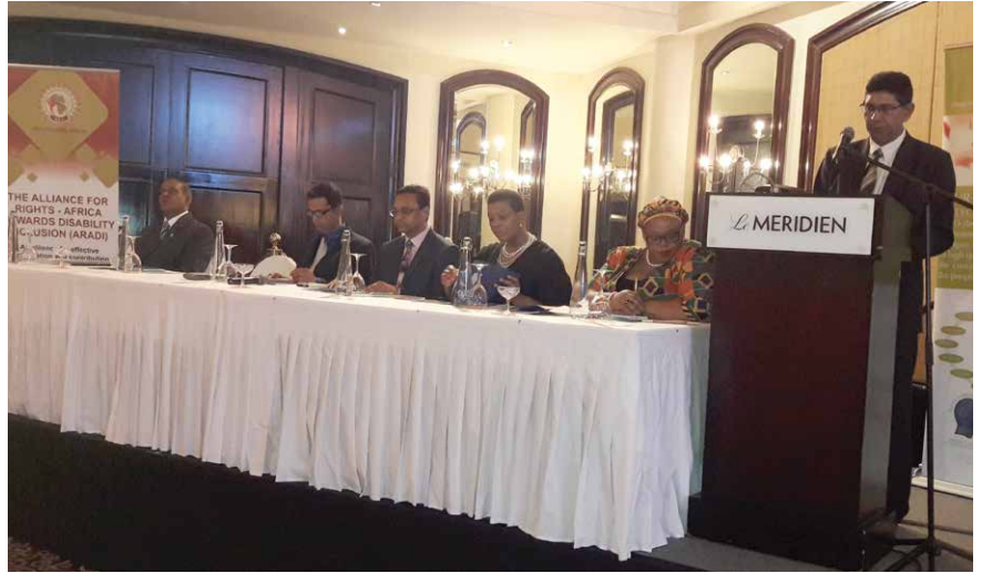
Le Meridien Hotel - Multi-Stakeholders Workshop