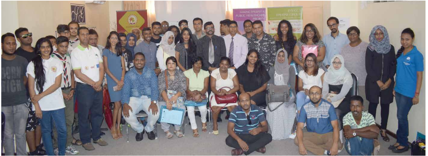
Le Saint Georges Hotel - Youth Training Workshop