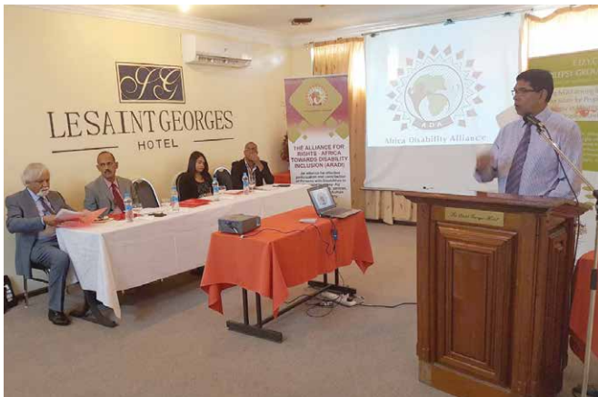
Le Saint Georges Hotel - Business and Corporate Workshop