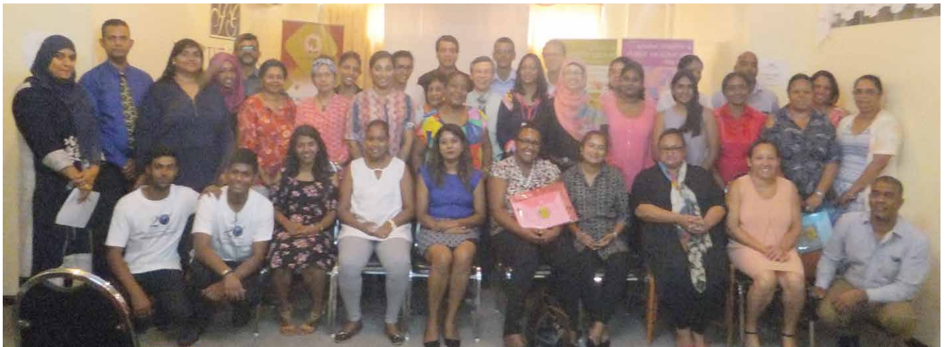
Le Saint Georges Hotel - Women Training Workshop