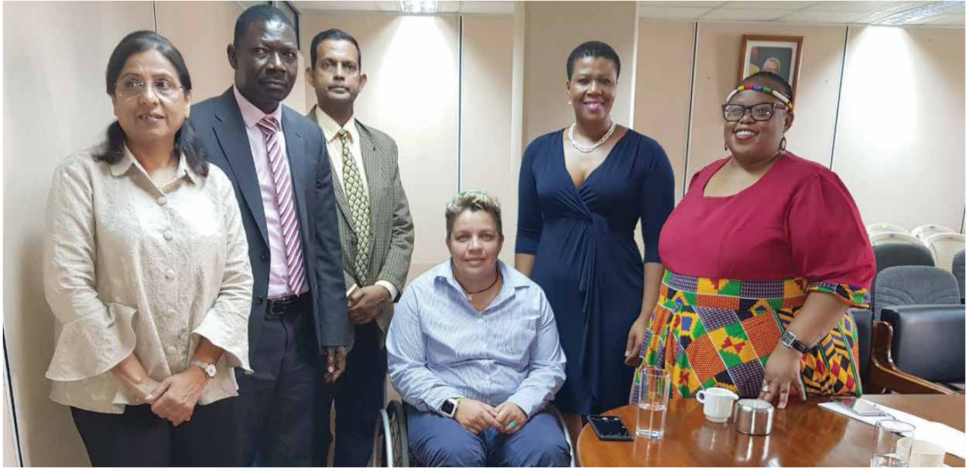
Meeting with Vice-Prime Minister Honourable Fazila Jeewa-Daureeawoo