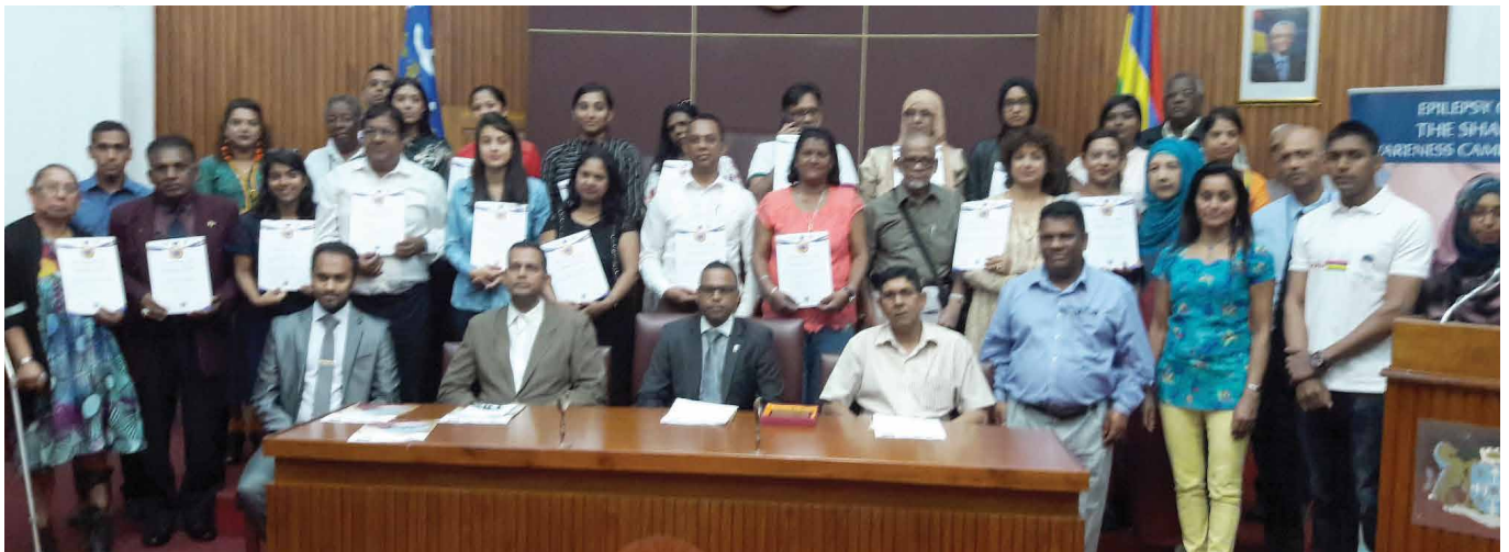
Official Launching of Edycs ARADI Advocacy Group - Mauritius